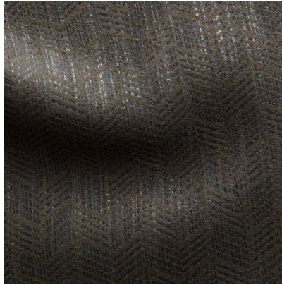
Stormy Navy Metallic Stripes