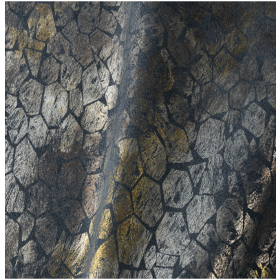
Blue Moon Multi Pewter

The Terrapin collection illustrates an eye-catching series of geometric shapes in a distressed, metallic finish. Inspired by the patterned shell of the Terrapin turtle, no two shapes are quite the same, creating a one-of-a-kind effect.