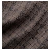
Smoke Super Black Matte