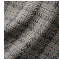
Stormy Super Black Matte