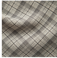
Cream Super Black Matte