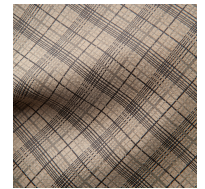
Taupe Super Black Matte