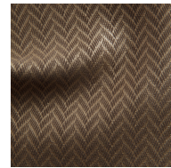
Smoke Taupe Pearl