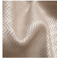
Stormy Taupe Pearl