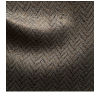
Stormy Copper Pearl