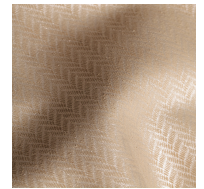
Taupe Taupe Pearl