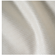
Cream Taupe Pearl