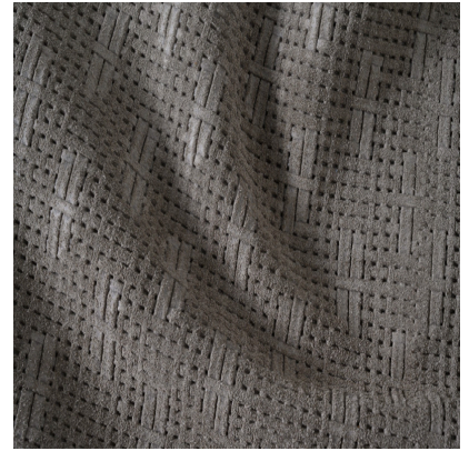
Satin Suede Smoke