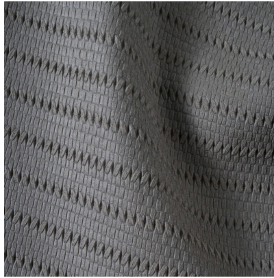
Satin Suede Smoke