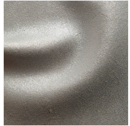
Cream Silver Matte