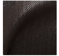
Espresso Black Pearl