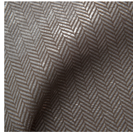
Smoke Hammered Silver