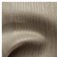
Cream Rose Gold