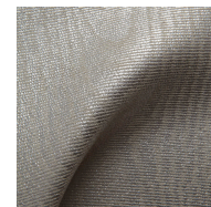
Cream Silver Matte