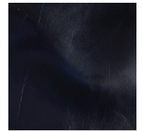
Black and Blue