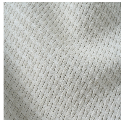
Satin Suede Cream