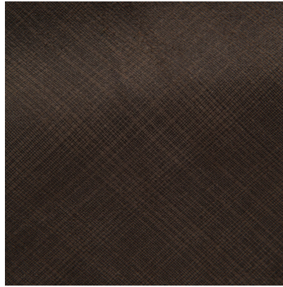
Smoke Super Black Matte