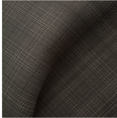
Stormy Super Black Matte